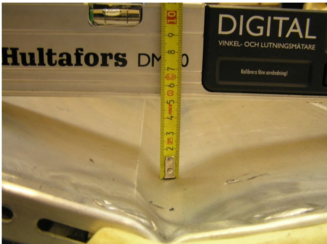
Figure 6, Measuring the horizontal deformation of the seat back