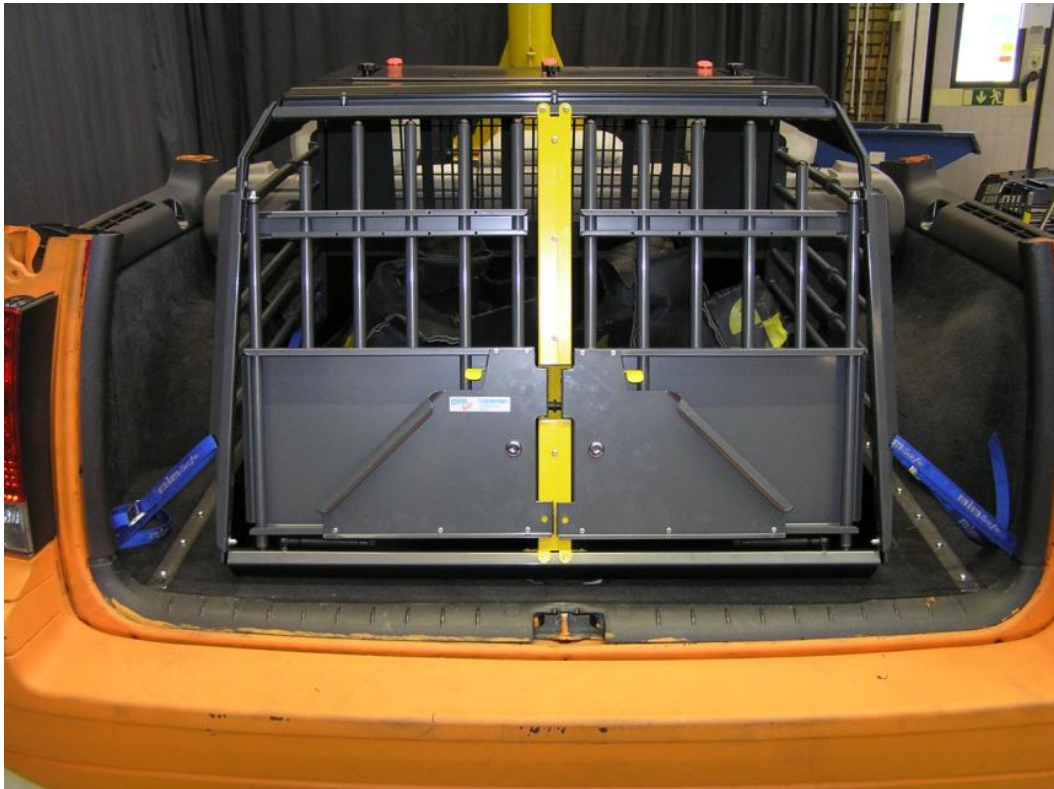
Figure 1, Set-up, frontal impact test