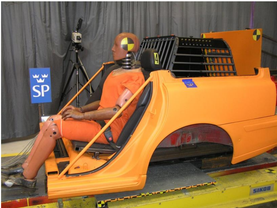
Figure 2, Set-up, rear impact test