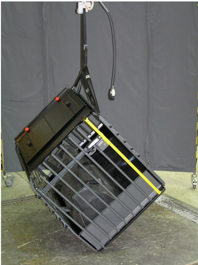
Figure 8, Angle adjustment of the test object before the drop test