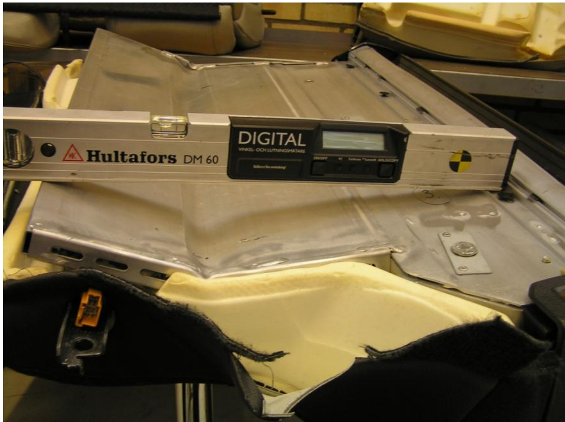
Figure 5, Measuring the horizontal deformation of the seat back