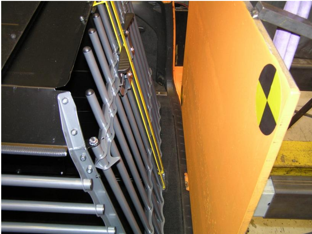
Figure 3, The crash barrier position when the crash bars starts deforming (braking)